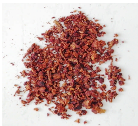
Figure 4 Ground bark of Ceriops tagal