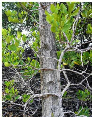
Figure 1 Tree of Ceriops tagal