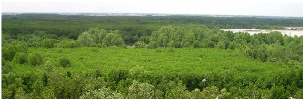
Figure 3 An abandoned salt pan planted with Ceriops tagal